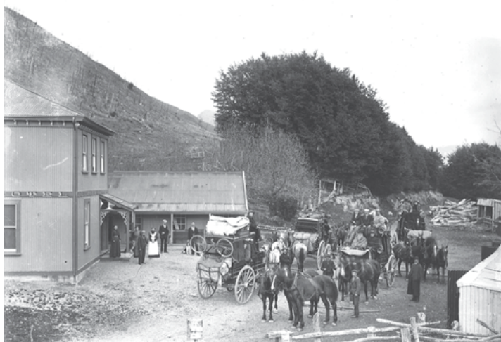
Coaches at Glacier Hotel, Bealey c. 1900

On the knob just to the south of this plaque are the remains of one of the concrete 'monuments' from which surveying for the tunnel was done.